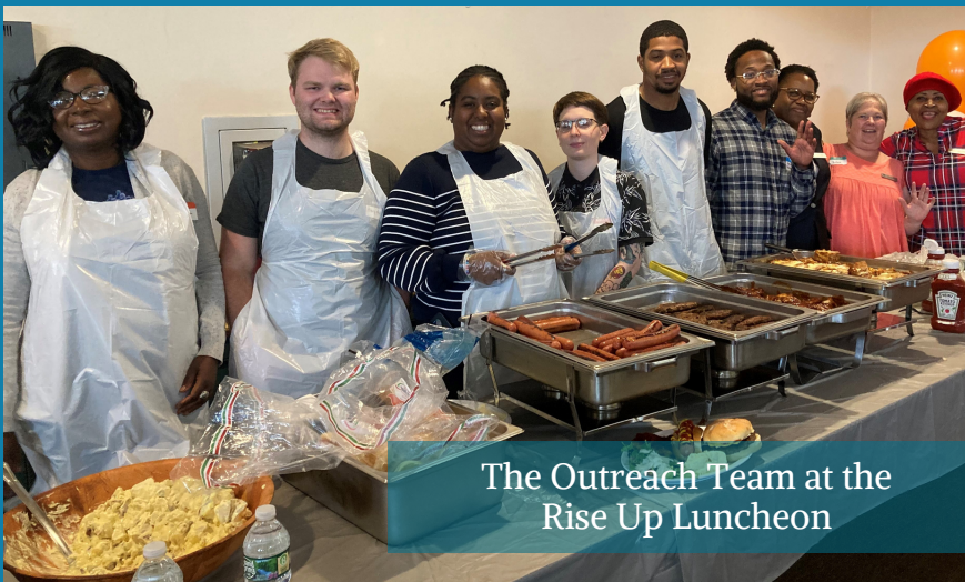
The Outreach Team at the Rise Up Luncheon

Hearth's success would not be possible without generous funders. One of our most steadfast sources of support for our Outreach program is the Bushrod H. Campbell and Adah F. Hall Charity Fund . Supporters since 1995, this fund has bolstered our capacity to reach vulnerable elders in the shelter system and get them sustainably housed. All of us at Hearth are grateful.